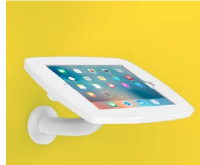
BRANCH (MOUNTS TO WALL) The Branch lets your walls do the talking, getting close to your customers without a big footprint.