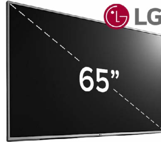
65" LG SCREEN