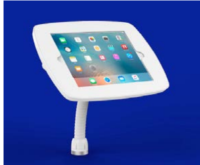
FLEX (MOUNTS TO DESK) The Flex offers a full range of movement, making content available at every angle without getting in a twist.