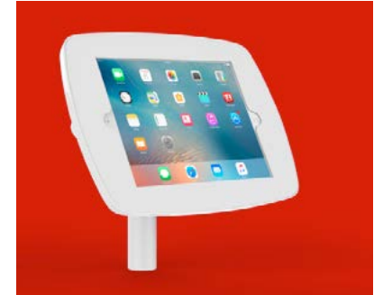
STATIC 60 (MOUNTS TO DESK) The Static 60 stands tall, acting as a bright focal-point to attract passers-by.