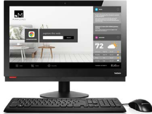
LENOVO M910Z AIO PC (UNIGUEST CONNECT AND CONNECT +BUSINESS CENTER)