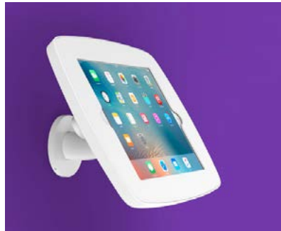
WALLMOUNT Put your vertical space to work with the Wallmount.