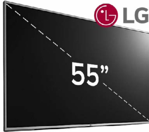
55" LG SCREEN