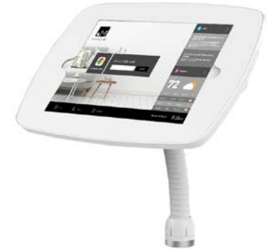
MS SURFACE PRO 4 TABLET (OPTIONAL) (UNIGUEST CONNECT BUSINESS CENTER)