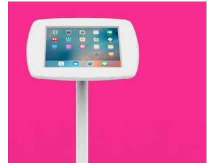
FLOORSTANDING The Floorstanding commands attention and invites interaction, standing alone without any fittings or fixtures.