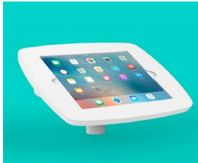
DESK The Desk lies low on on your surface, displaying content at the perfect angle for easy interaction.