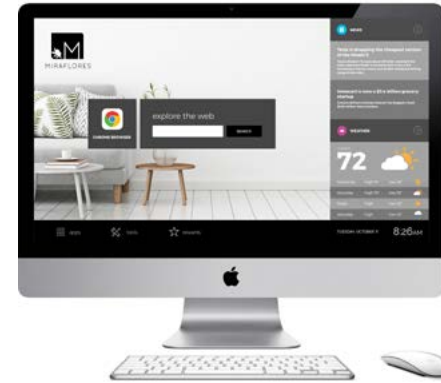
APPLE IMAC (UNIGUEST CONNECT AND CONNECT +BUSINESS CENTER)